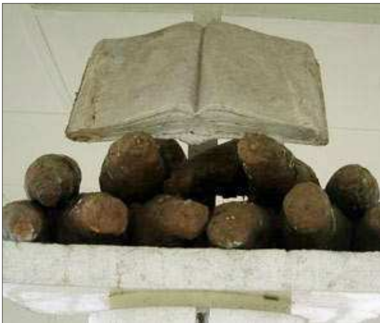
Bible site, Araya

"So, the police work between the board and hotel associations. Like Warri, Sapele and Asaba hotel associations and others. So, whatever comes up, we liaise between hotels hospitality establishments and the police for any security issues that come up. Hotels in the state are registered with the state government,